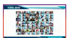
ICEEL 2022 (Online)

More information, please kindly check http://iceel.org/history.html