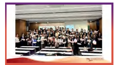
ICEEL 2024 (Tokyo, Japan)