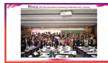
ICEEL 2025 (Tokyo, Japan)