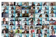
ICEEL 2022 (Online)