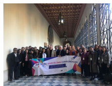
ICEEL 2019 (Barcelona, Spain)