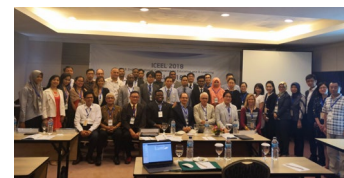
ICEEL 2018 (Bali, Indonesia)